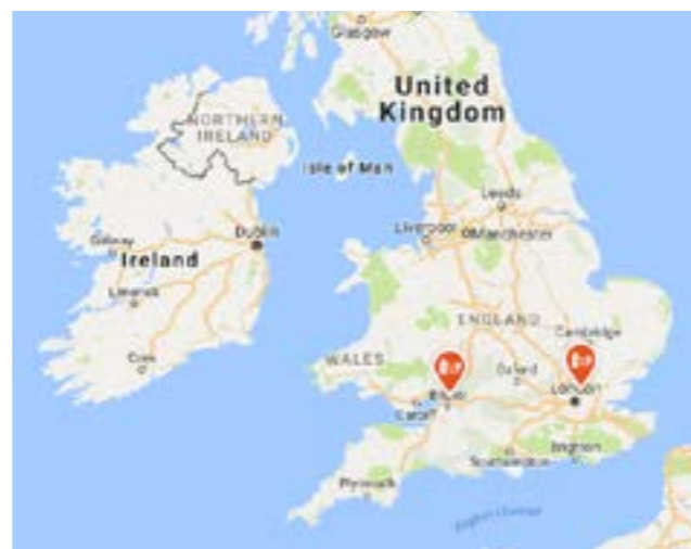
↑ Location of plug-in hybrid buses in the UK

While plug-in hybrid buses offer zero tailpipe air pollution and CO 2 emissions when operating in electric mode, like full EVs the carbon footprint of the electricity to charge the bus needs to be taken into consideration. When a plug-in hybrid bus operates as a conventional hybrid, CO 2 emission savings will be achieved. The latest plug-in hybrid buses meet Euro VI standards ensuring low emissions even when the engine is operating.