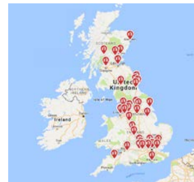
↑ Location of hybrid buses in the UK

Some hybrids can travel up to 1 km in all-electric mode. The latest Euro VI hybrid buses can achieve very low levels of emissions, offering benefits in cities with poor air quality whilst also helping to cut CO 2 emissions significantly.