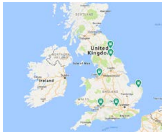
↑ Location of biomethane gas buses in the UK

The numbers of biomethane buses are set to grow. For example, Nottingham County Council has been awarded the OLEV Low Emission Bus Grant to purchase 55 biomethane buses and associated CNG refuelling infrastructure.