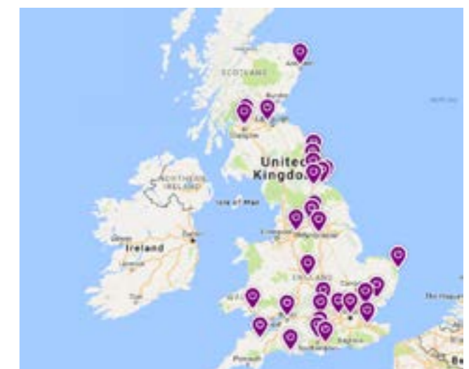
↑ Location of electrified ancillaries in the UK

There are currently 1,091 diesel buses equipped with electrified ancillaries operating across twenty regions of the UK. First Bus has spearheaded the adoption of this technology and operates the largest fleet in the country. The regions operating the highest number of electrified ancillary buses are Glasgow, Bristol and Hampshire.