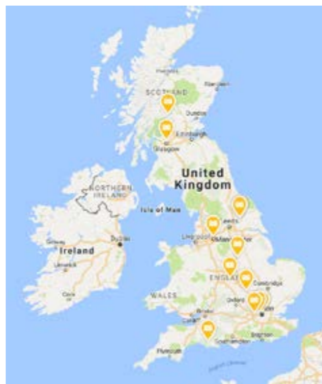
↑ Location of electric buses in the UK

One of the biggest drivers of the introduction of electric buses is the fact that they produce zero tailpipe air pollution emissions. They are also much quieter than a conventional diesel bus. The well-to-wheel greenhouse gas emissions of an electric bus when charged using the UK electricity grid are more than 60% lower than a typical diesel bus, and the increasing use of renewable electricity will further reduce the carbon footprint of electric buses.