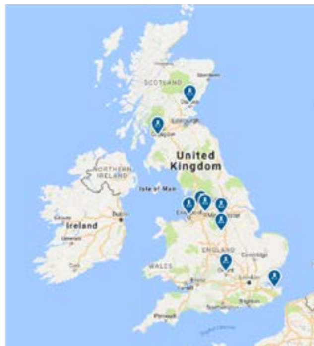
↑ Location of biodiesel buses in the UK

Producing biodiesel from waste oils is sustainable and results in much greater greenhouse gas savings than producing biodiesel from crop-based oil. Biodiesel produced from tallow oil can achieve up to 90% reduction in GHG emissions. Further emission reductions are possible through the use of locally-sourced waste materials by avoiding CO 2 emissions associated with the road distribution of feedstocks.